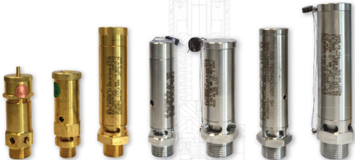
Safety valves for compressed air and inert gases

Design and manufacture operations are aimed at solving all real problems directly connected with plant engineering, maintenance and general performance.